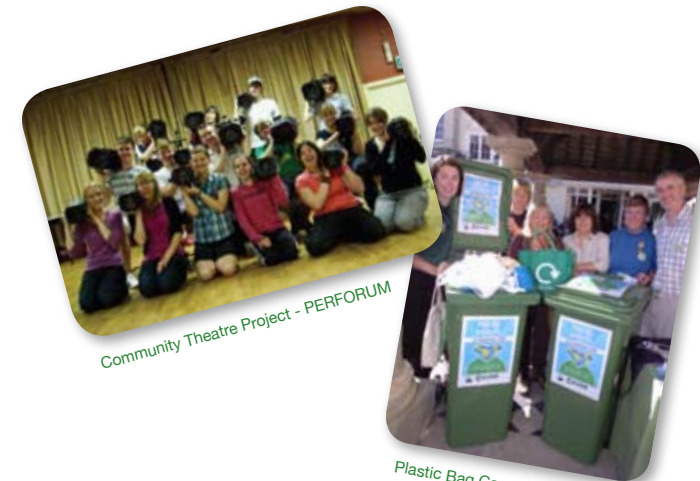
Community Theatre Project - PERFORUM