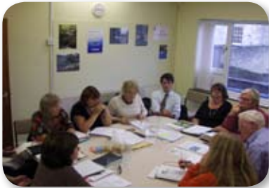
A ChAP Steering Group meeting

ChAP offers a voice for the community and champions its needs and priorities.